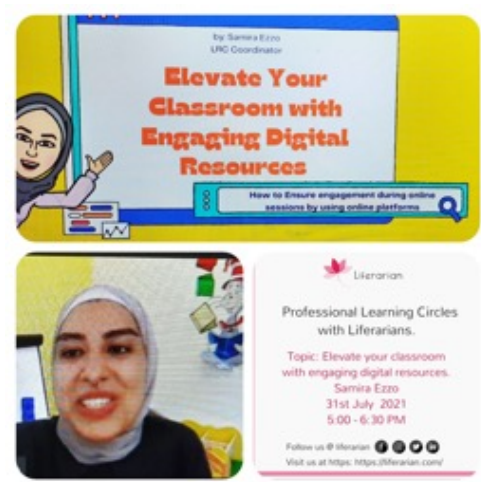
Spicing up Class with engaging Digital Resources

The pandemic has changed the way librarians teach and support learning. Books were suddenly not available, our facilities lay fallow, and resources were considered too dangerous or difficult to circulate. Nevertheless, it did not stop